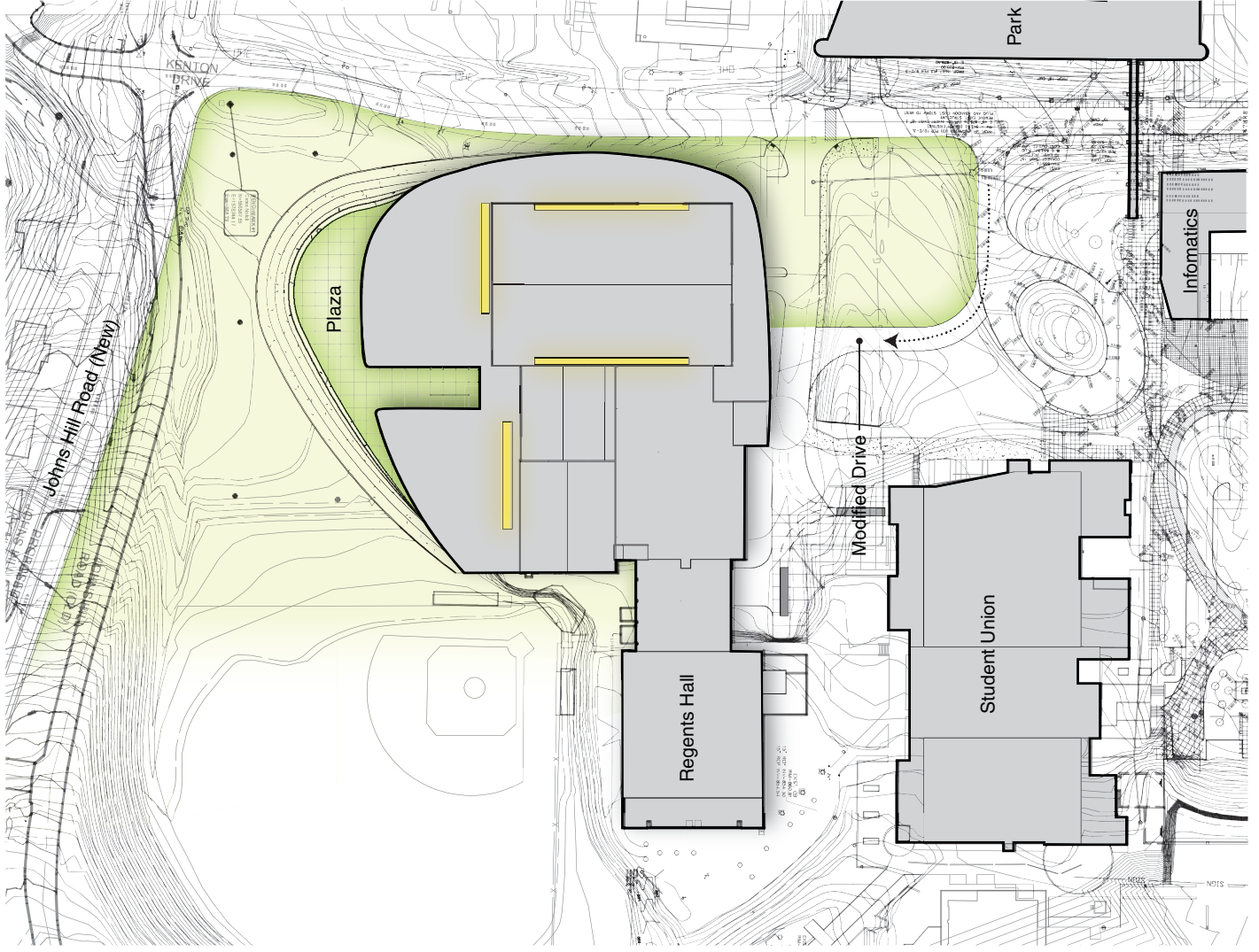
Scheme A Site Plan North